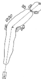
Figure 2 Measuring set-up for a Par-4 Hole