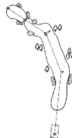
Figure 3 Measuring set-up for a Par-5 Hole